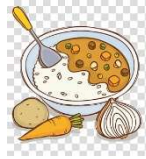
Curry and rice